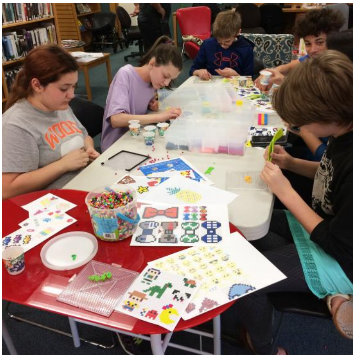
Teen After School Activities on school early release day (October 24) involved creating with perler beads.