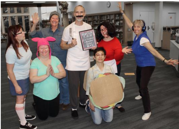
For Halloween, library staff dressed up as characters from the animated TV series "Bob's Burgers".