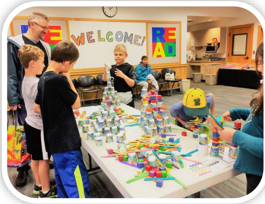
"Science Zone" youth program on school early release day, October 24.