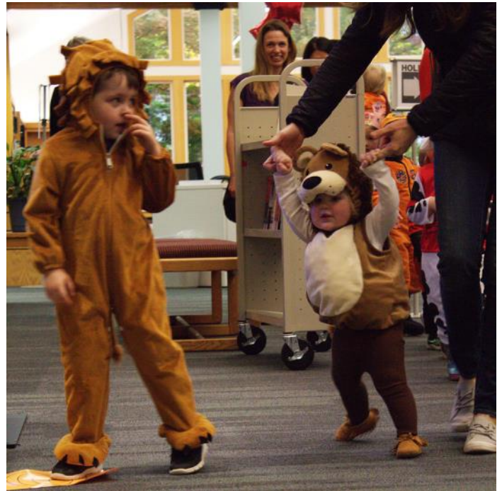
"Pumpkin Patch Polka" participants after Storytime.