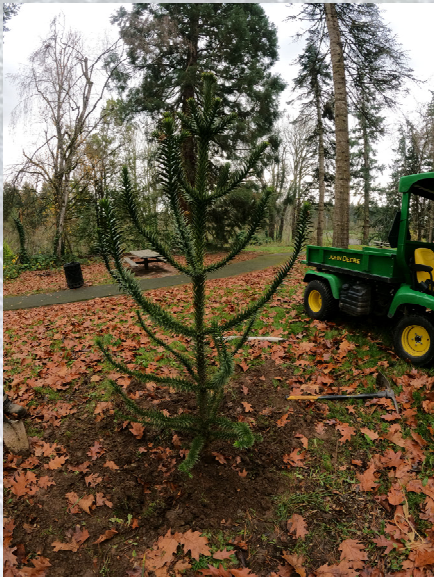
Monkey Puzzle in Murase

The Parks team has been hard at work mitigating the unprecedented damage from the 2021 Ice Storm. The heavy rain and cold conditions of December did not deter the team from planting 50 new trees in parks across the city. The team will continue with plantings and plant a total of 125 trees in response to the ice storm