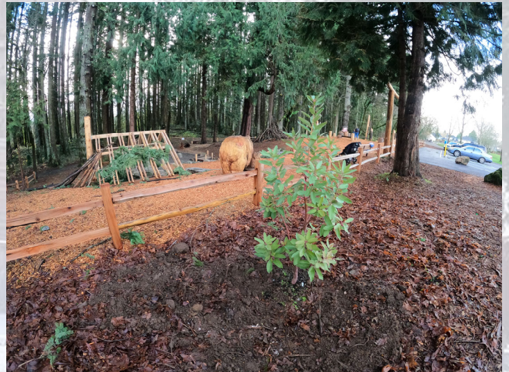
Madrone in Memorial Park