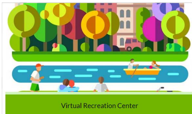
Virtual Recreation Center

For those looking for free virtual activities for the whole family, check out the Virtual Recreation Center! The VRC offers free resources to keep kids and families engaged in healthy, educational activities. Categories in the Recreation Center include; arts and crafts, education and learning, health and fitness, library resources, mind and body, nature and outdoors, and youth sports.