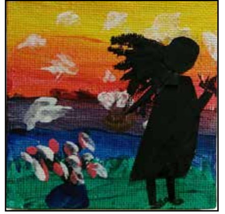
Say You Will Remember Me