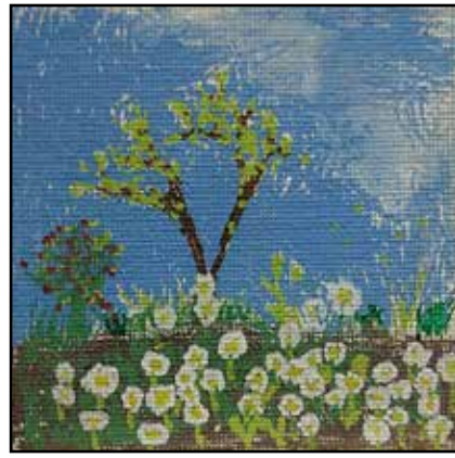
Tree in Flower Meadow