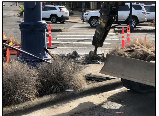
Pedestrian ramps at Wilsonville Road and Boones Ferry Road