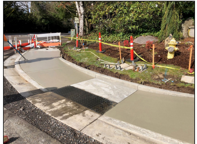
Pedestrian ramps at Wilsonville Road and Rose Lane

The pedestrian crossing improvements include seven street crossings on French Prairie Road in Charbonneau. These improvements will include new or updated signing and striping to enhance the safety and visibility of pedestrians. This work will occur in late April and May 2023.