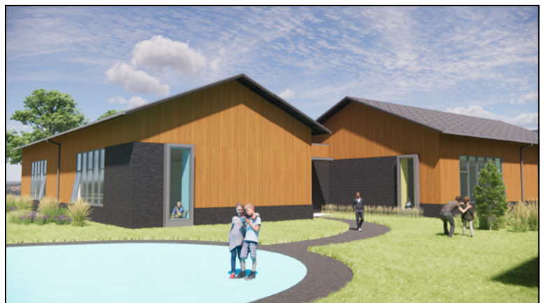
Rendering of Proposed Primary School in Frog Pond West