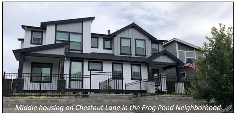
Middle housing on Chestnut Lane in the Frog Pond Neighborhood

On September 8, the Planning Commission held a public hearing regarding the proposed updates to the Comprehensive Plan, Frog Pond West and Villebois Master Plans, Old Town Neighborhood Plan, and Development Code. Considering the information from the hearing and the information gained over eight work sessions, the Planning Commission unanimously recommended approval of the proposal to City Council with minor edits. At a September 20 work session, staff updated the City Council on the Planning Commission recommendation. The City Council is scheduled to hold a public hearing on October 4 for final adoption of the proposal.