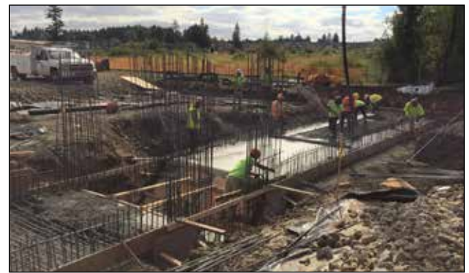
Construction workers place rebar and pour concrete for the Kinsman Road extension project.

The project design team was led by OBEC Consulting Engineers, and Emery and Sons Construction Group of Salem managed the construction project. The water-supply pipe was manufactured by Northwest Pipe Co., which specializes in large-diameter steel pipelines. A total of 90 local jobs are estimated to have been sustained during the course of the 12-month-long project.