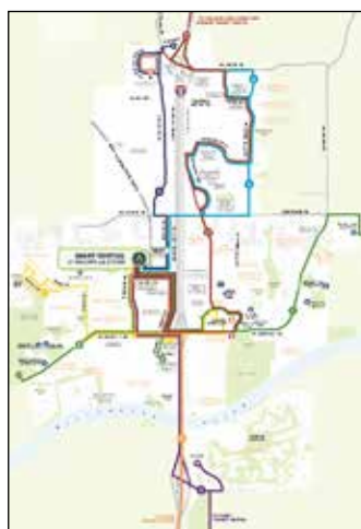
SMART Bus Route Map

During the second class on Friday, Feb. 16, 10-11:30 am, knowledge is put to the test as participants head out to ride SMART to SMART Central/WES Station. The free class meets at the Community Center.