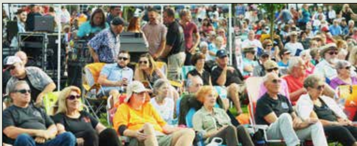
The popular Rotary Summer Concerts are funded in part by the City's Community Tourism Grant Program.

The City's Community Tourism Grant Program awards up to $25,000 in funds to organizations that produce projects, programs or events that promote local business and tourism, and for festivals and special events that draw visitors to Wilsonville.