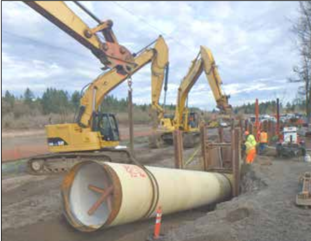
Installation of the first segment of 66-inch diameter Willamette Water Supply Program pipeline.

in order to more efficiently use taxpayer-funds. The Kinsman Road project included the installation of a $4.0 million segment of a major drinking-water pipeline and a $1.1 million sanitary sewer pipe. Simultaneous construction of the road, Willamette Water Supply Program (WWSP) water pipeline and City sewer project allowed various local governments to all