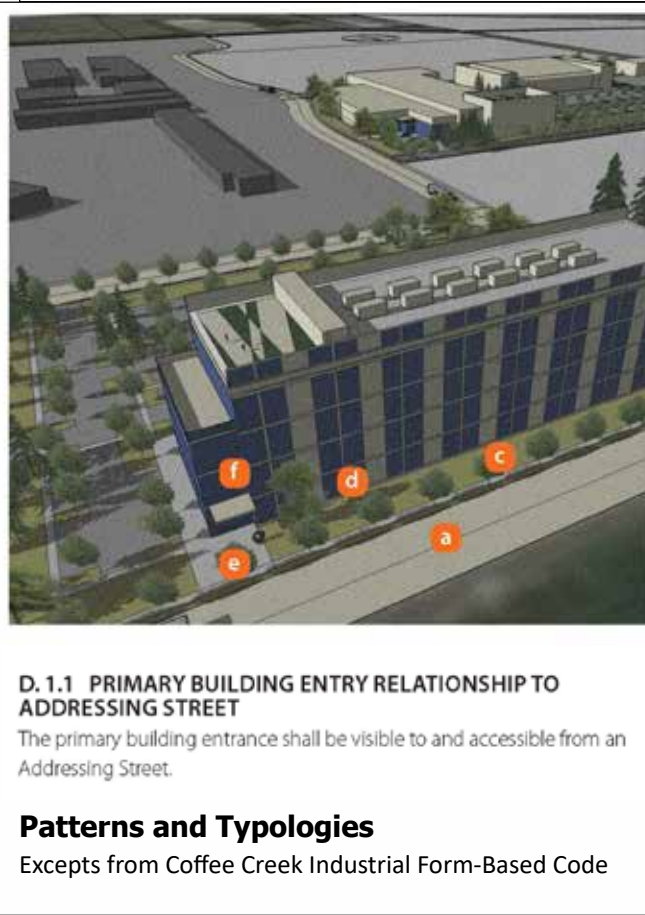
D. 1.1 PRIMARY BUILDING ENTRY RELATIONSHIP TO ADDRESSING STREET The primary building entrance shall be visible to and accessible from an Addressing Street.