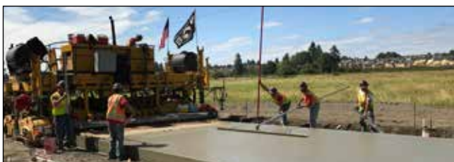
Construction workers smooth-out new concrete for the Kinsman Road extension project along the Coffee Creek Lake wetlands just east of Villebois.

Wilsonville Community Development Department staff announced the opening during the week of Jan. 15 of the new Kinsman Road extension, which connects Barber Street to Boeckman Road, that was completed on budget and five months ahead of schedule. In addition to providing another routing