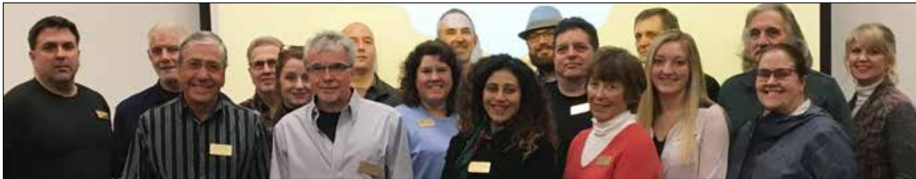
Members of the 2018 Wilsonville Citizens Academy, composed of area residents, gather for a photo during the class' first meeting in January, and said that they look forward to learning more about local government.