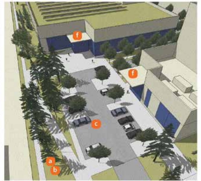
D. 1.1 PRIMARY BUILDING ENTRY RELATIONSHIP TO ADDRESSING STREET The primary building entrance shall be visible to and accessible from an Addressing Street.