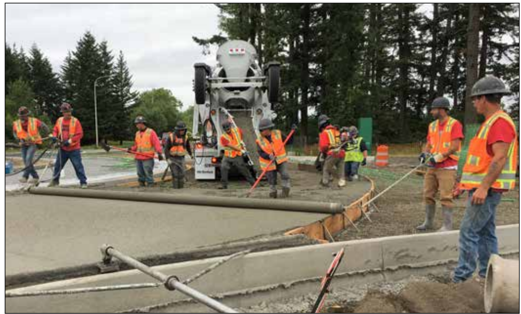
Workers pour, roll flat and smooth out concrete road surface for enlarged roundabout at the intersection of Kinsman and Boeckman Roads.

Funding for the combined $13.7 million road-sewer-water pipeline project came from City transportation and wastewater system development charges, federal/state funds (U. S. Dept. of Transportation Multimodal Transportation Enhance Program (MTEP) through the Statewide Transportation Improvement Program (STIP) and Surface Transportation Program Urban (STP-U)), and the ratepayers of TVWD and City of Hillsboro.