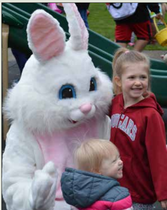
A photo op with the Easter bunny at Wilsonville's annual Community Egg Hunt drew ear-to-ear smiles.