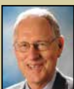
Tim Knapp Mayor

The City Council usually convenes on the first and third Monday of the month at City Hall, with work session generally starting at 5 pm and meeting at 7 pm. Meetings are broadcast live on Comcast/Xfinity Ch. 30 and Frontier Ch. 32 and are replayed periodically. Meetings are also available to stream live or on demand at www.ci.wilsonville.or.us/WilsonvilleTV . Public comment is welcome at City Council meetings.