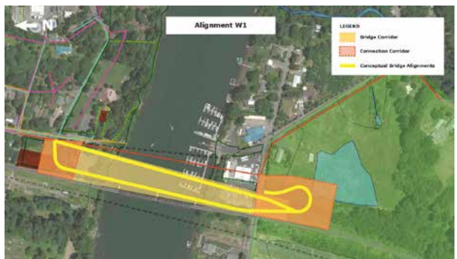
An aerial view (with Wilsonville at left) of the bridge location recommended by the French Prairie Bridge Task Force at its April meeting.