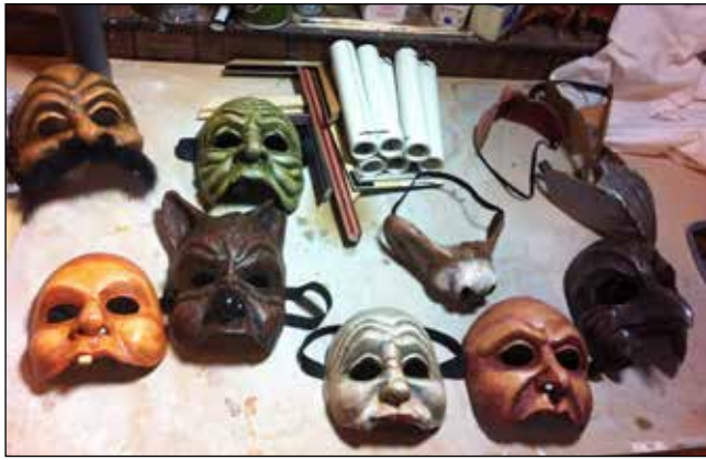
Guests attending the Wilsonville Festival of Arts can expect to find a wide array of crowd-pleasing entertainment, including a mask-making workshop (left) and 13 scheduled live performances, including DanceAbility (right).

A collaboration with Portland's Northwest Film Center, Micro Movie Theatre, showcases 20 short films