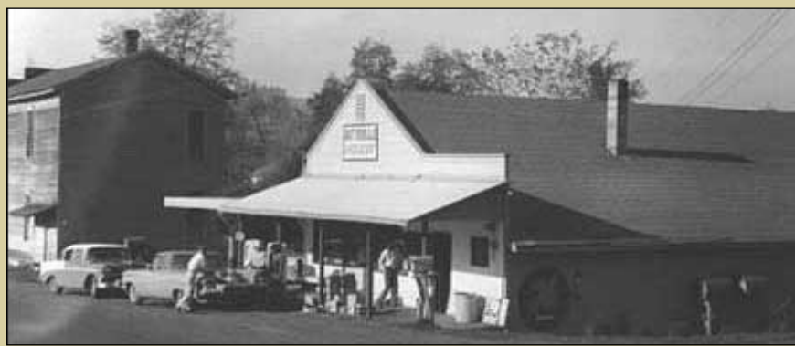
Butteville Store, circa 1961 [Photo courtesy Oregon Historical Photo Collection, Salem Public Library].

The store is open weekends until Memorial Day, and then open every day 9 am–6 pm. For more information, go online to www.butteville.org or contact Ben Williams at 503-568-5670 or Dori Brattain at 503-678-1605.