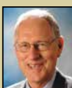
Tim Knapp Mayor

The City Council usually convenes on the first and third Monday of the month at City Hall, with work session generally starting at 5 pm and meeting at 7 pm. Meetings are broadcast live on Comcast/Xfinity Ch. 30 and Frontier Ch. 32 and are replayed periodically. Meetings are also available to stream live and by video-on-demand at www.ci.wilsonville.or.us/WilsonvilleTV . Public comment is welcome at City Council meetings.