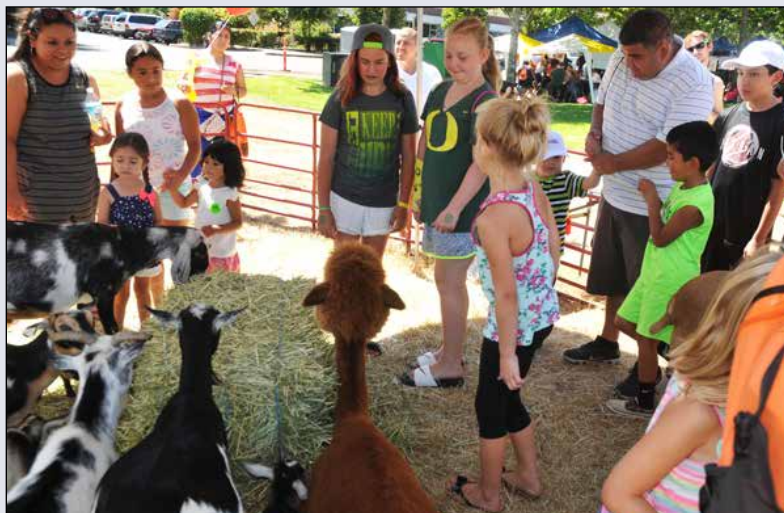
City tourism funds support the annual Fun in the Park event in August.