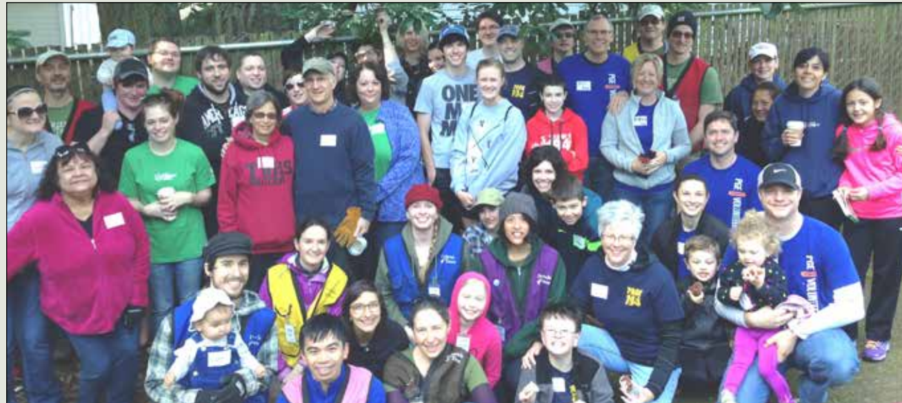
Last April over 50 local volunteers joined City and Friends of Trees staff to celebrate Arbor Day by planting over 360 native trees and shrubs and also pulling ivy at Tranquil Park in Wilsonville.