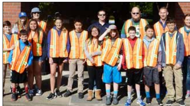
Wood Middle School students and staff volunteered at last year's community shredding event.

The event is free, but participating community members are encouraged to make a financial contribution to a Wood Middle School program that teaches seventh graders about leadership and community involvement.