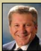
Scott Starr City Council President