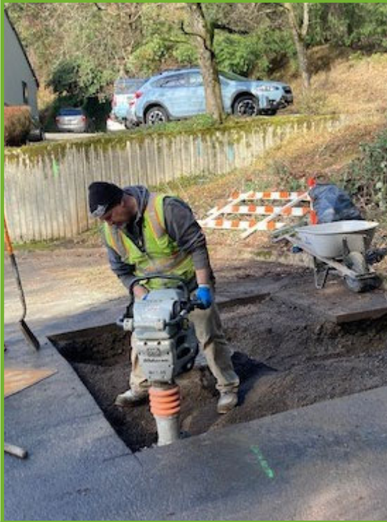
Working at the sinkhole

In January, a sinkhole was discovered on Saint Helens Court near a failed stormwater manhole, which caused a cavity under the asphalt to develop over time. Staff finished up the final repairs at the beginning of the month, before moving on to routine culvert maintenance tasks. Annual inspection and maintenance is underway for culverts, which can include some extra bushwhacking and trimming.