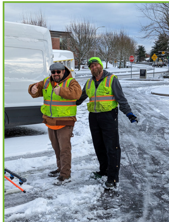
Ready to respond!