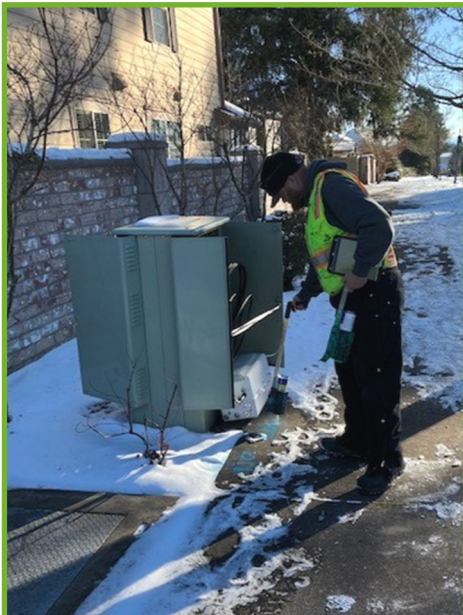
Performing a utility locate

In addition to their normal sewer maintenance tasks, staff assisted with other assignments, including completing utility locates, helping out with Utility Billing's shut off day, sealing water infrastructure structures, such as vaults and covers, and helping out with stormwater structure repairs.