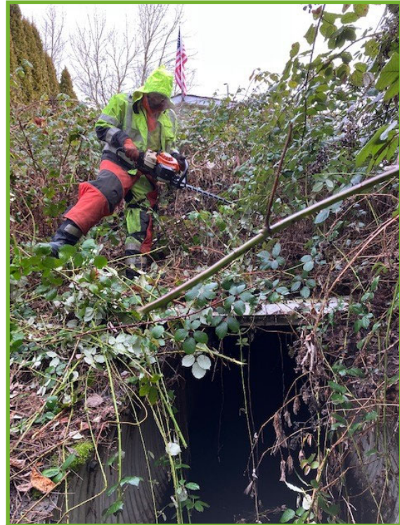
Trimming back blackberries