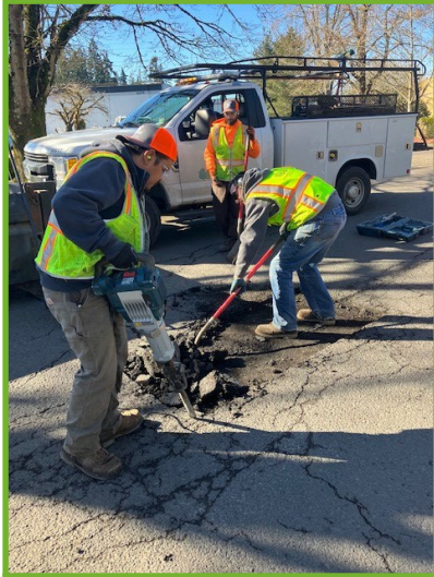
Cutting out the old surface

The crew completed hot asphalt patching in the northwest corner of the city. Availability of asphalt delayed repairs but staff took full advantage of good weather earlier in the month.