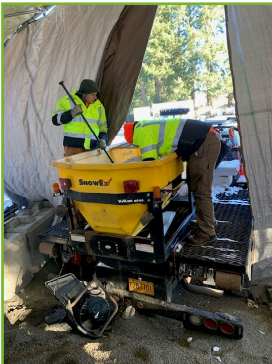
Preparing the sanding trailer

February brought record-breaking snowfall to the region. Although Wilsonville did not receive as much snow as areas farther north, the crews were still hard at work implementing the City's Snow and Ice Control Plan. De-icing was an important part of our response. De-icer is made of magnesium chloride, a type of salt mixed with a binder, which works best in temperatures between 35—26 F. It can be applied ahead of predicted winter conditions or laid directly on snow and ice to start the melting process. Our crews prioritize safe access to essential services, such as the fire department, the water treatment plant, the wastewater plant, and other City buildings.