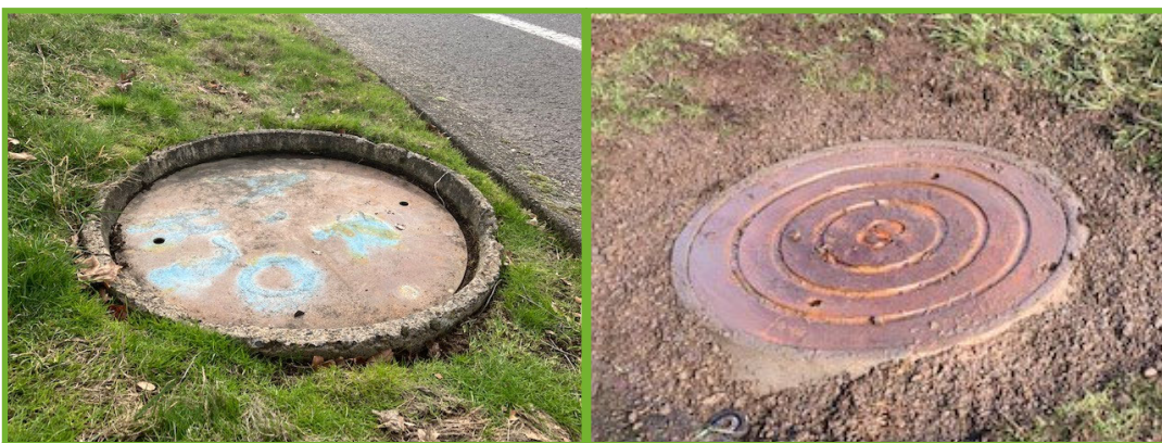
Manhole Repairs—Before and After