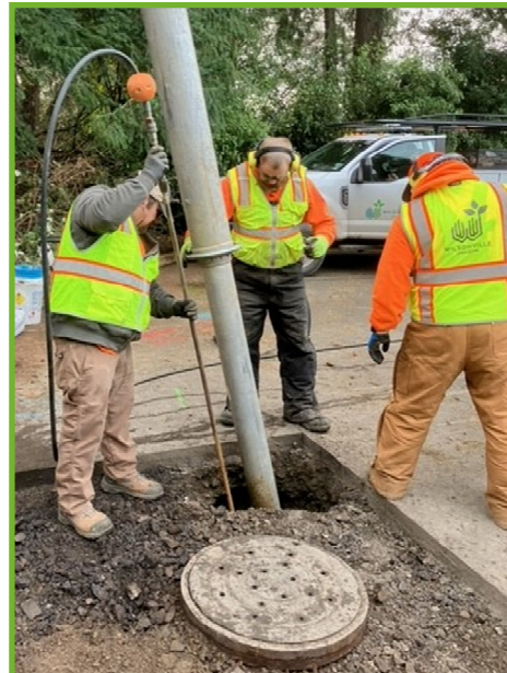
Vactoring a sinkhole