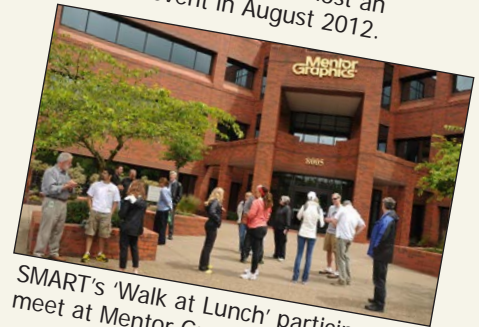
SMART's 'Walk at Lunch' participants meet at Mentor Graphics in June 2013.