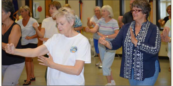
Senior residents practice Tai Chi at a Parks & Rec class held at the Community Center.

In May, the City's newest large, regional park opened in the Villebois 'urban village' neighborhood. Piccadilly Park, located in the western portion of Villebois and east of Grahams Ferry Road, is open to the public and offers trail extensions, play and picnic areas, a volleyball court and horseshoe pits. Constructed as part of the "Tonquin Woods" development by Polygon Northwest, Piccadilly Park was funded primarily through private sources and City fees on new developments.