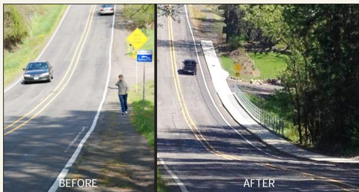
Before and after pictures of the bike/ped improvements to the Boeckman Road “Dip.”

■ Boeckman Road “Dip” Bike/Ped Improvements: A new sidewalk and improved bike lane along the segment of Boeckman Road that drops down at Canyon Creek filled a key gap in the pedestrian network and greatly improves safety.