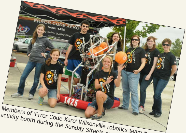
Members of 'Error Code Xero' Wilsonville robotics team host an activity booth during the Sunday Streets event in August 2012.