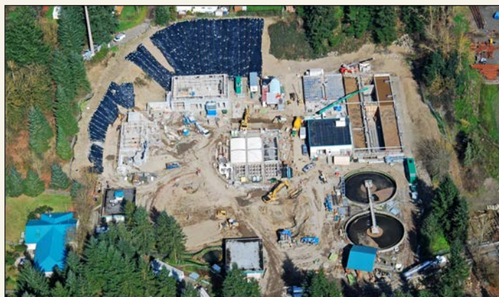
Aerial view of Wastewater Treatment Plant under construction.

■ Wastewater Treatment Plant Upgrade: The $36 million Wastewater Treatment Plant upgrade begun in 2011 has made substantial progress on time and on budget, with construction about 75% complete. The total capacity of the facility is being increased by 160% and other improvements include odor control and better effluent disinfection.