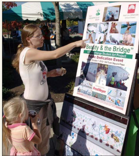
Attendees look at photos of student-made art tiles at the October 2012 'Beauty & the Bridge' I-5 interchange dedication event.