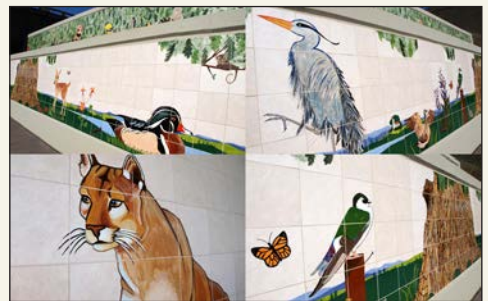
Collages of decorative art-tiles produced by Wilsonville public school students for the "Beauty & the Bridge" I-5 interchange student art project, which was part of the larger I-5/Wilsonville Road interchange improvement project completed in 2012.