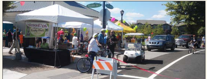
Sunday Streets event station at Sofia Park in Villebois.

The new facility was constructed to improve current operations and accommodate future demand for transit services. The operations center is centrally located in close proximity to SMART transit center and has more efficient work space that is more convenient and cost effective to operate and fuel the buses. The 12,500-square-foot building has two wings, one for administration and the other for maintenance, and is built of concrete instead of pre-engineered steel to lower maintenance costs and improve durability. The wash bay could be converted to a repair bay, and an area is designated for future expansion and for a drive-through wash and fuel station.