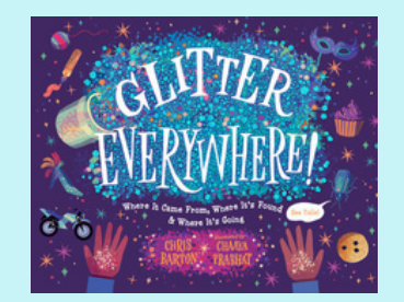
Glitter Everywhere: Where It Came From, Where It's Found, and Where It's Going by Chris Barton

A unique title that beautifully captures a move to another country. The illustrations are resplendent in revealing the emotions of the characters, as well as the dichotomy of blending, and embracing, two different worlds.