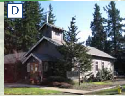
D St. Cyril's Catholic Church, built in 1926