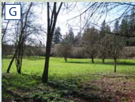
G The site of Bill Flynn's Saloon