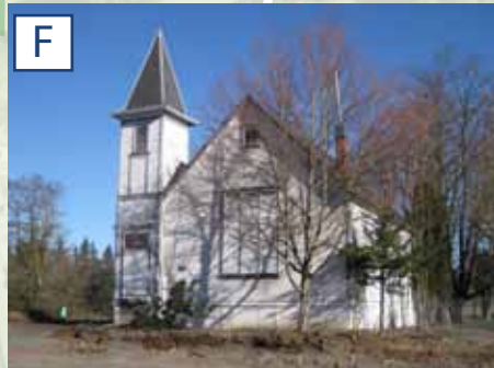
F Dedicated in 1911 and used until 1988, the Methodist Church property was originally purchased for $1.