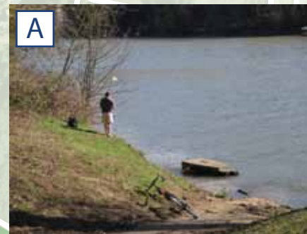
A Ferry service was operational at Boones Ferry Landing from 1847 until 1954, when the freeway and bridge were completed, and experienced as many as 300 river crossings a day in its heyday.