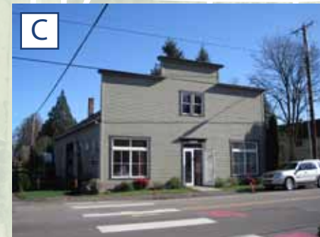
C Norris Young machine shop