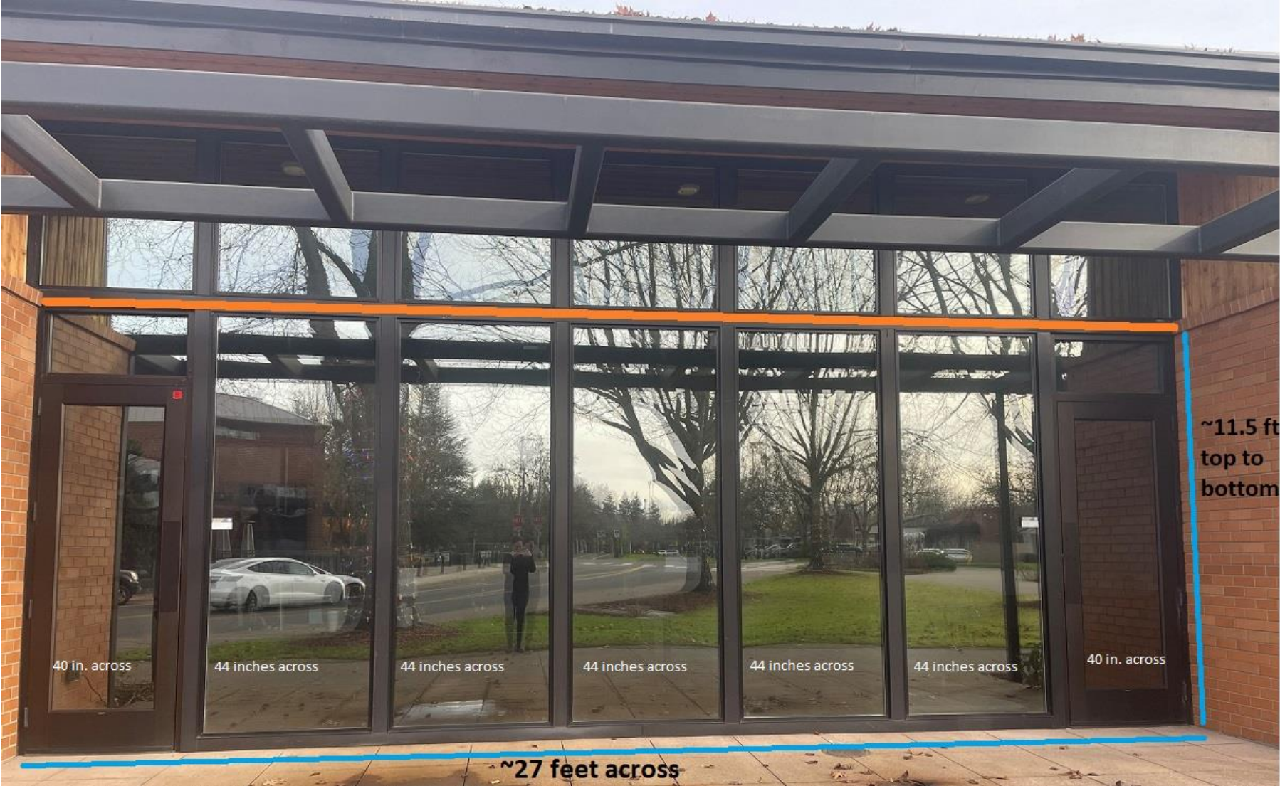
Image of Site. Mural will be on area UNDER the orange line. Windows are found at the Parks & Recreation Admin. Building 29600 Park Pl. Painting on exterior outside glass ONLY (no painting on black framing). Approx 310 Sq Ft. Measurements are not exact.